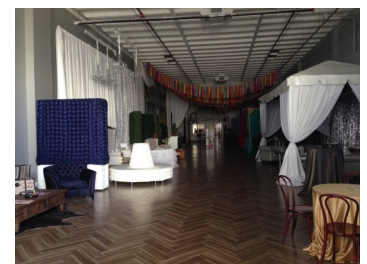
The lobby, interior displays and warehouse for Event Rental.