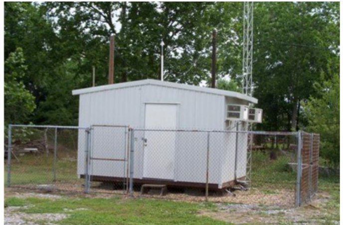
New Roads AQS 22-077-0001