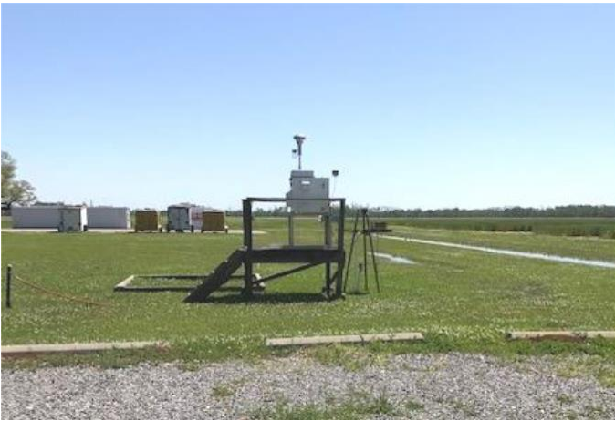
Alexandria AQS 22-079-0002