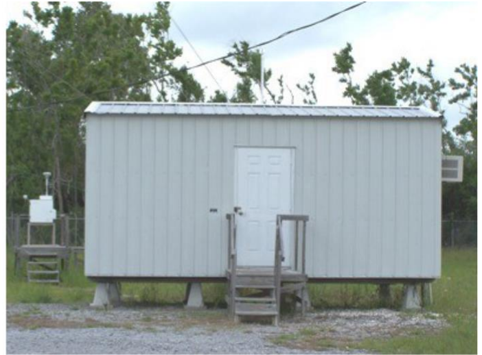
Vinton AQS 22-019-0009