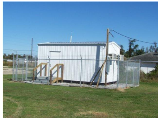
Meraux AQS 22-087-0004