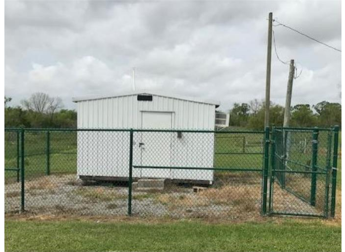
St. Martinville AQS 22-099-0001