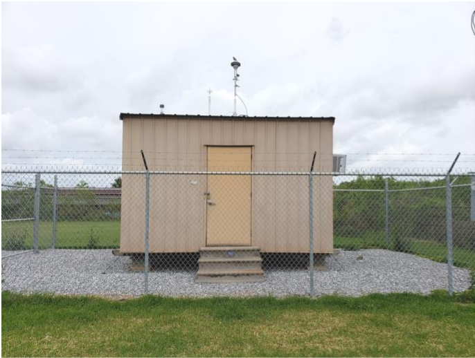
Thibodaux AQS 22-057-0004