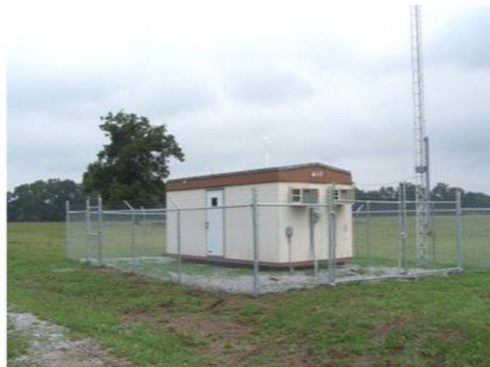
Carville AQS 22-047-0012