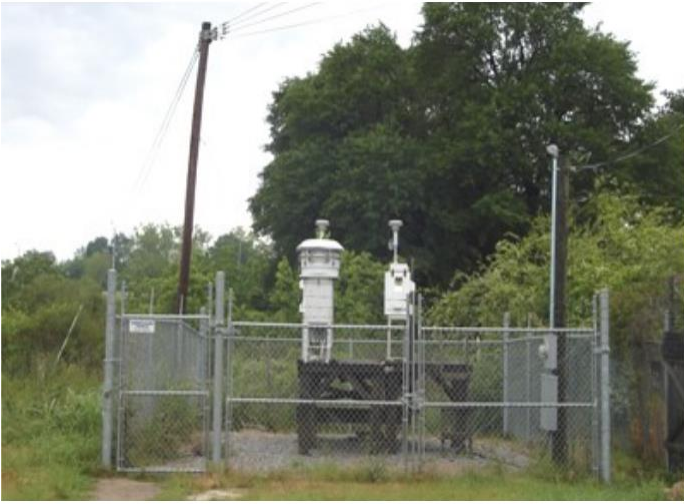
Shreveport Calumet AQS 22-017-0008