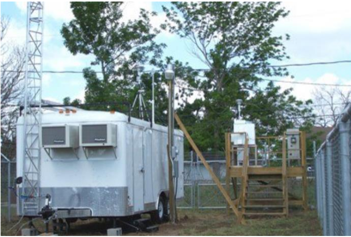
Chalmette Vista AQS 22-087-0007