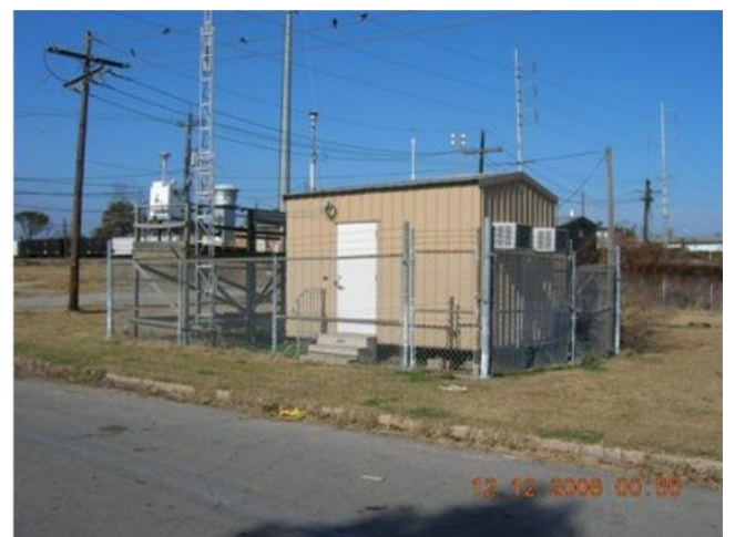
New Orleans City Park AQS 22-071-0021