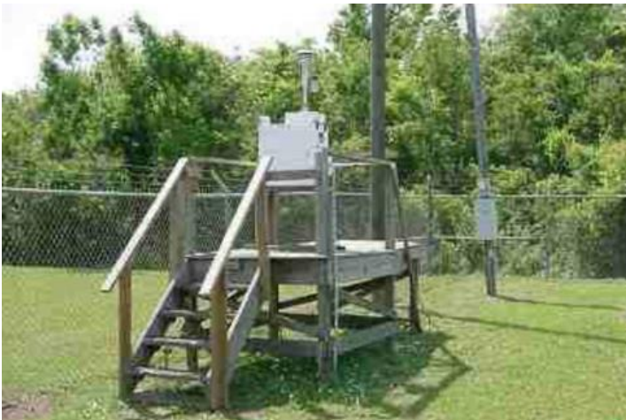
Houma AQS 22-109-0001