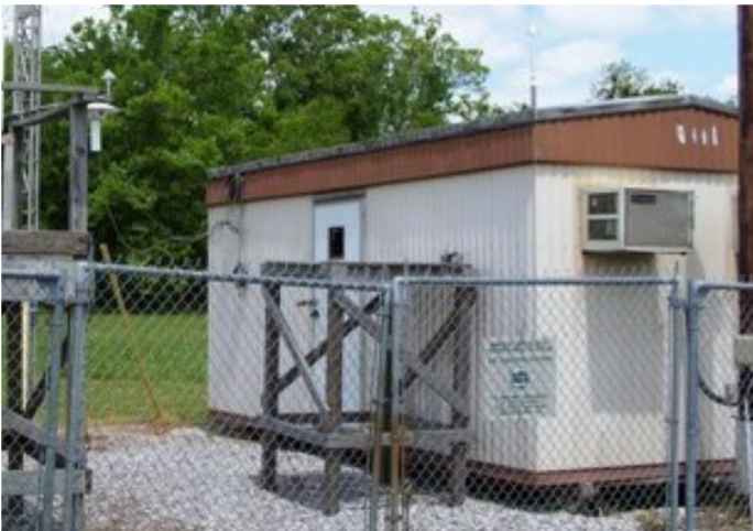
Bayou Plaquemine AQS 22-047-0009