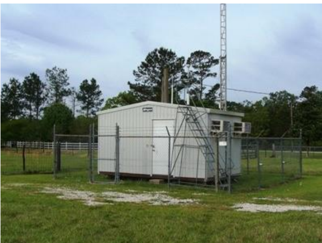
French Settlement AQS 22-063-0002