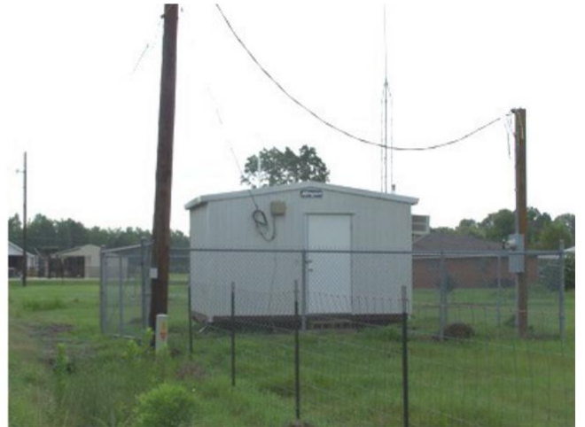
Dutchtown AQS 22-005-0004