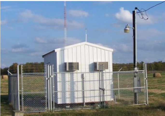
Dixie AQS 22-017-0001