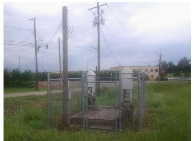
LaPlace AQS 22-095-0003