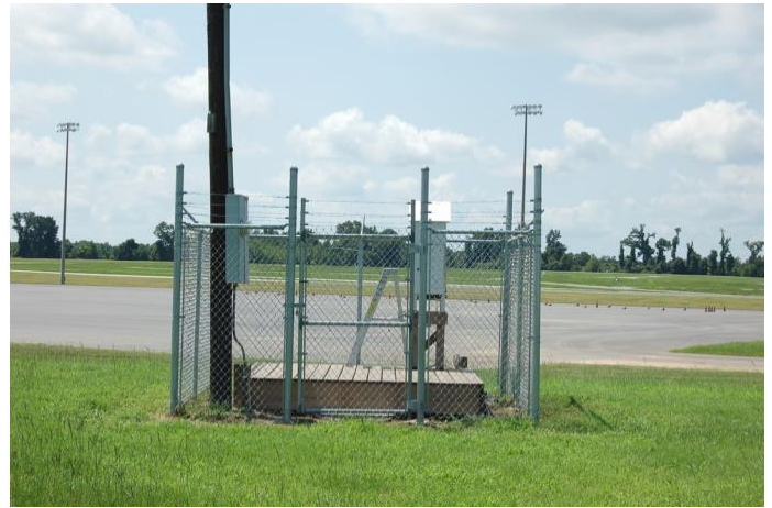
Baker AQS 22-033-0014