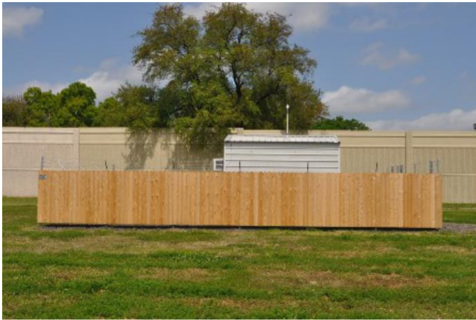
New Orleans Near-Road AQS 22-071-0021.