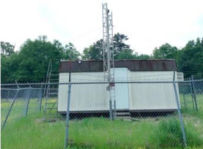
Pride AQS 22-033-0013