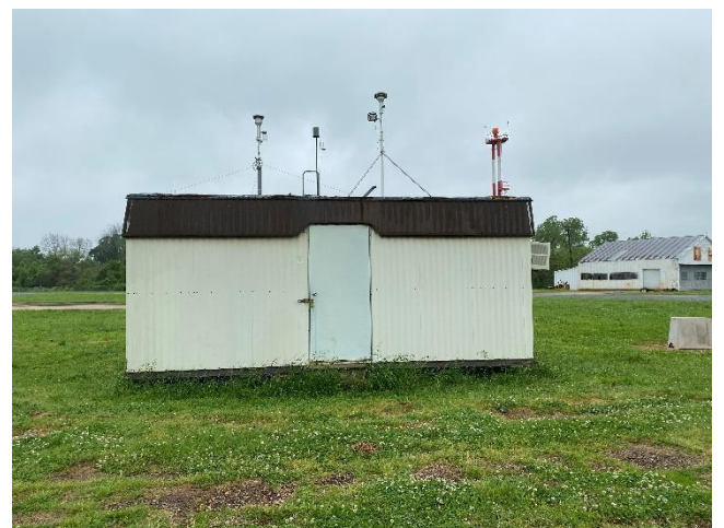
Shreveport Airport AQS 22-015-0008