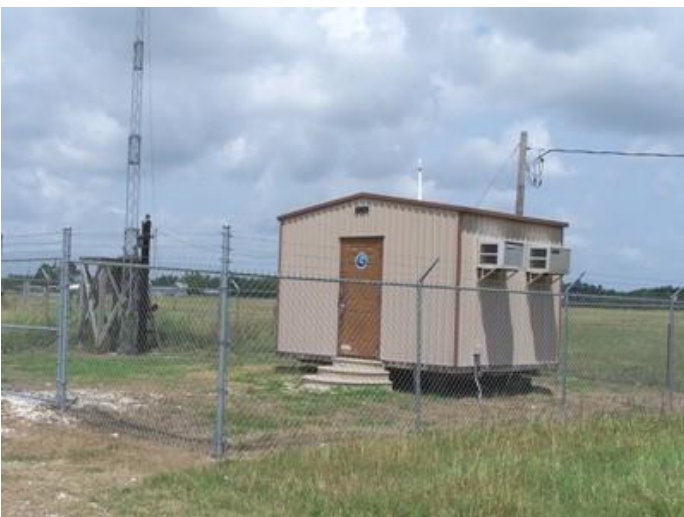
Carlyss AQS 22-019-0002