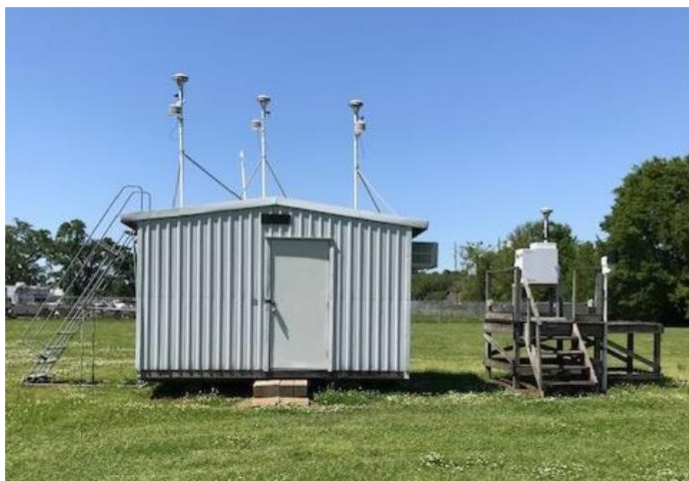
Lafayette USGS AQS 22-055-0007