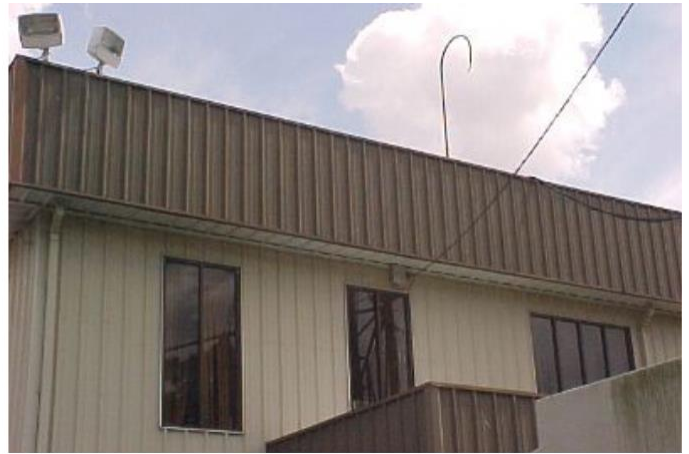
Convent AQS 22-093-0002