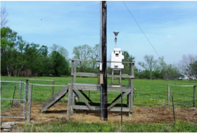
Geismar AQS 22-047-0005