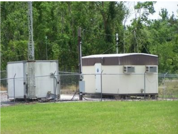
Westlake AQS 22-019-0008