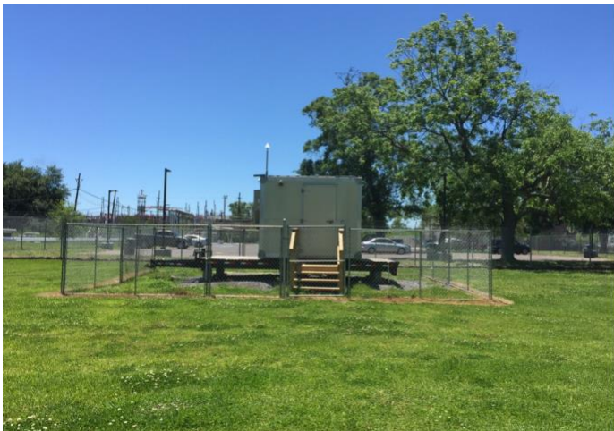
Norco AQS 22-089-0006