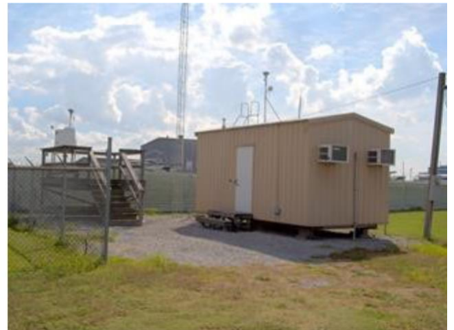
Port Allen AQS 22-121-0001