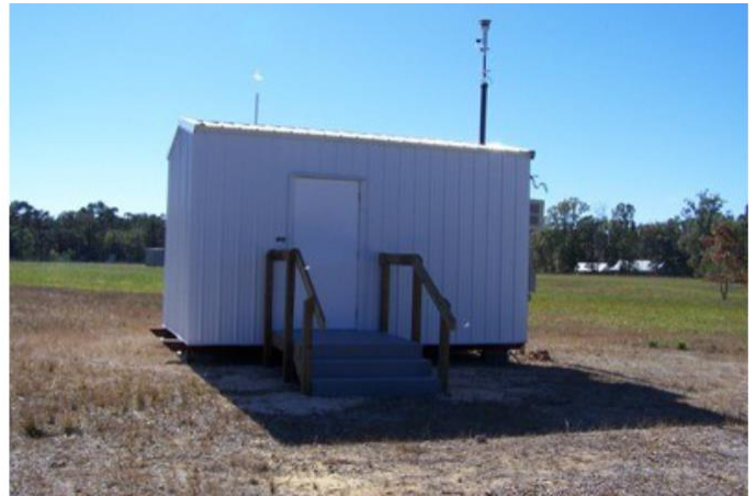
Madisonville AQS 22-103-0002