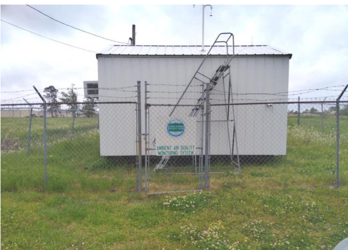
Monroe AQS 22-073-0004