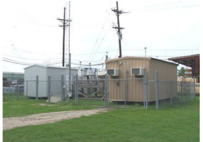
Capitol AQS 22-033-0009