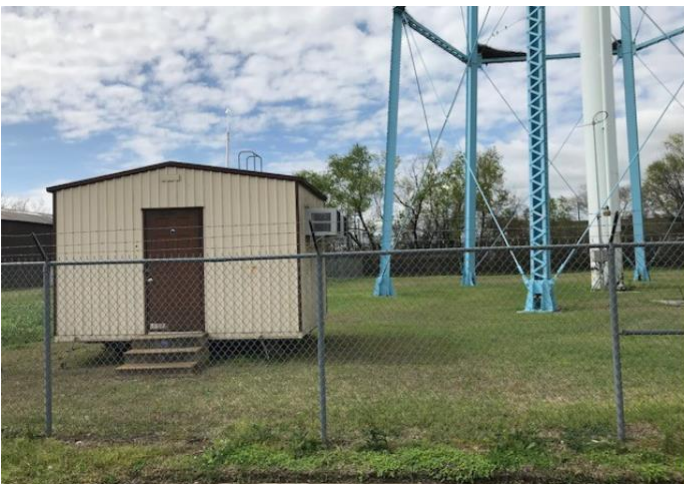
Marrero AQS 22-051-2001