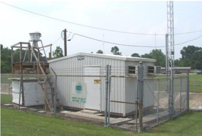
LSU AQS 22-033-0003.