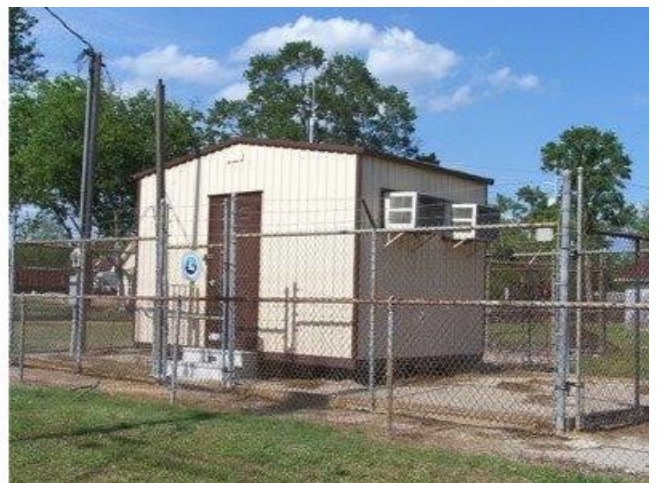
Garyville AQS 22-095-0002