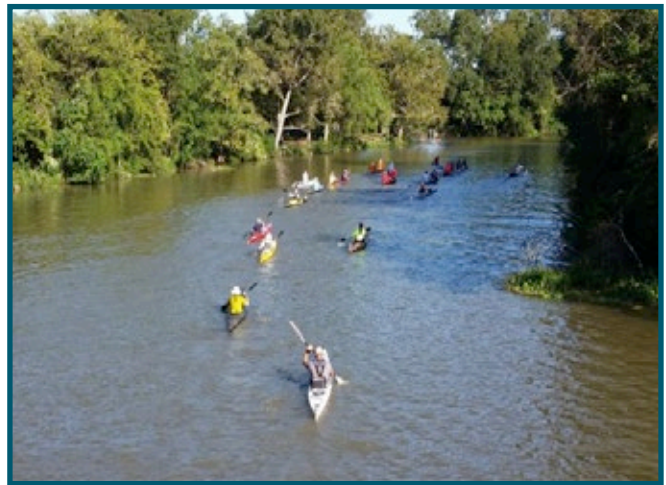
Figure 7. Bayou Teche Paddle Trail