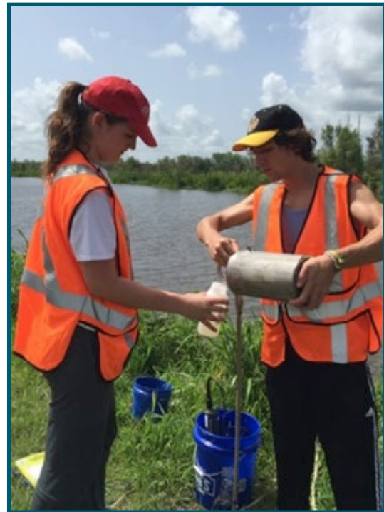
Figure 4. Bayou Land Interns using sewage sampler.