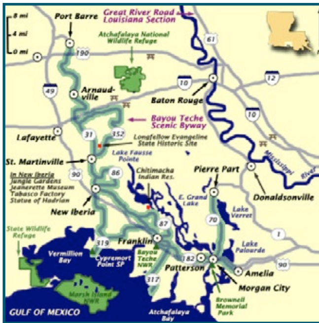
Figure 6. Map of Bayou Teche and Surrounding Parishes

The U.S. Department of the Interior recognized the Bayou Teche Paddle Trail as a National Waters Trails System in January 2015. This designation is the 18th of its kind in the United States, and is due in large part to the Teche Project, a non-profit group advocating for improved water quality in the Bayou Teche Watershed through the reduction of NPS pollution. At 135 miles in length the Bayou Teche snakes through four (4) parishes from Port Barre to Morgan City