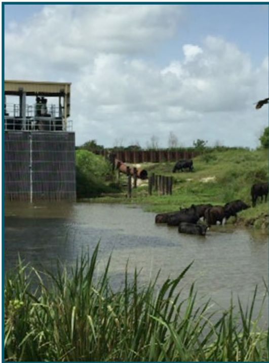
Figure 3. Cattle in Bayou Folsé near Lake Drive Pump Station