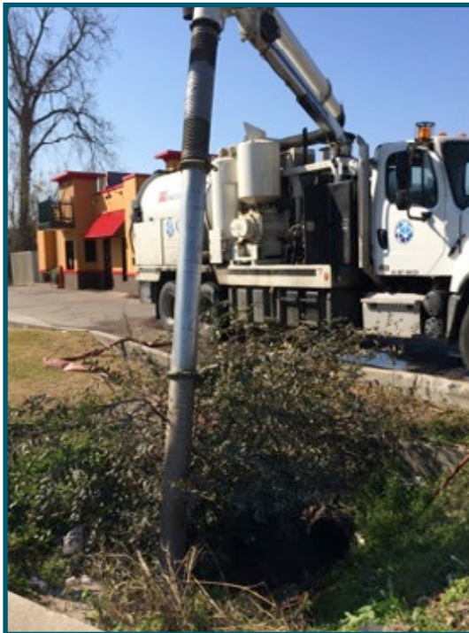
Figure 8. Vacuum truck removing sludge from a culvert.

LDEQ DWP staff coordinated with the Louisiana Department of Health and Hospitals (LDHH) and the BTNEP on a repair/replacement project for malfunctioning individual home sewage treatment systems targeting systems contributing untreated sewage to the Bayou. Homeowners are referred to LDHH based on sampling analysis, and BTNEP offers funding to the homeowner for the required upgrades to get the system in compliance.