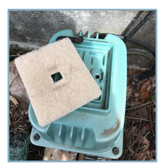
Figure 1: Well-maintained, properly functioning home waste system aerator

The goal of this project was to reduce NPS pollution with the objectives of improving surface water quality and restoring support for CWA designated uses, and maintaining healthy waters. This goal was accomplished by monitoring water quality to determine critical areas with high fecal coliform (FC) concentrations in the watersheds. These areas then became the focus of OSDS inspections to ensure properly functioning systems. Both Capital RC&D and partners worked together to accomplish the goals of the project. At the conclusion of the project, 2,882 OSDSs had been inspected. Of the 2,882 OSDSs inspected, 644 were found to be not working and 641 OSDSs were repaired/replaced. Capital RC&D estimated that a total load reduction of 12,179,000 colony-forming units of FC was achieved in the watersheds at the conclusion of the project.