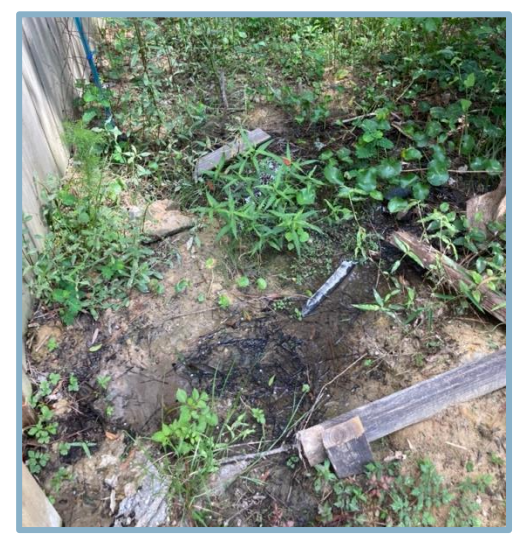
Figure 2: Sewage overflowing from an improperly managed home waste system

Capital RC&D commented that there were challenges in the project, since it was conducted during Covid-19 (including the Delta variant) and Hurricane Ida. Through close communication with partners LDH, USEPA, and the LDEQ NPS unit, they were able to adjust work schedules and locations and make progress in improving water quality.