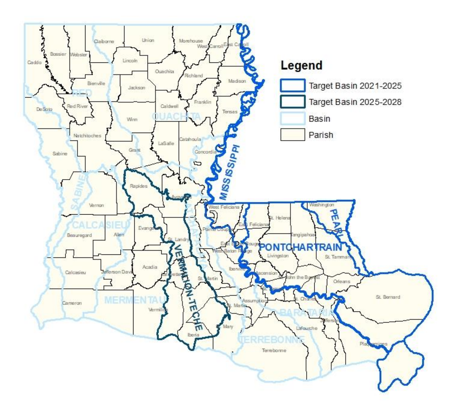
Figure 3: Source Water Protection Program Schedule