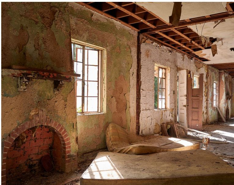
Top: A kitchen in one of the units pre-renovation. Bottom: Post-renovation photo of the Laura Suite Kitchen. Left: A living room area in one of the units pre-renovation.