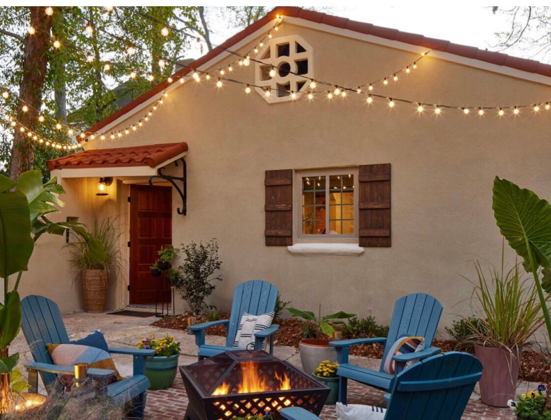
Top: Guests arriving at the newly renovated Villas at Spanish Court Bottom: Outdoor patio space for guests to enjoy during their stay.