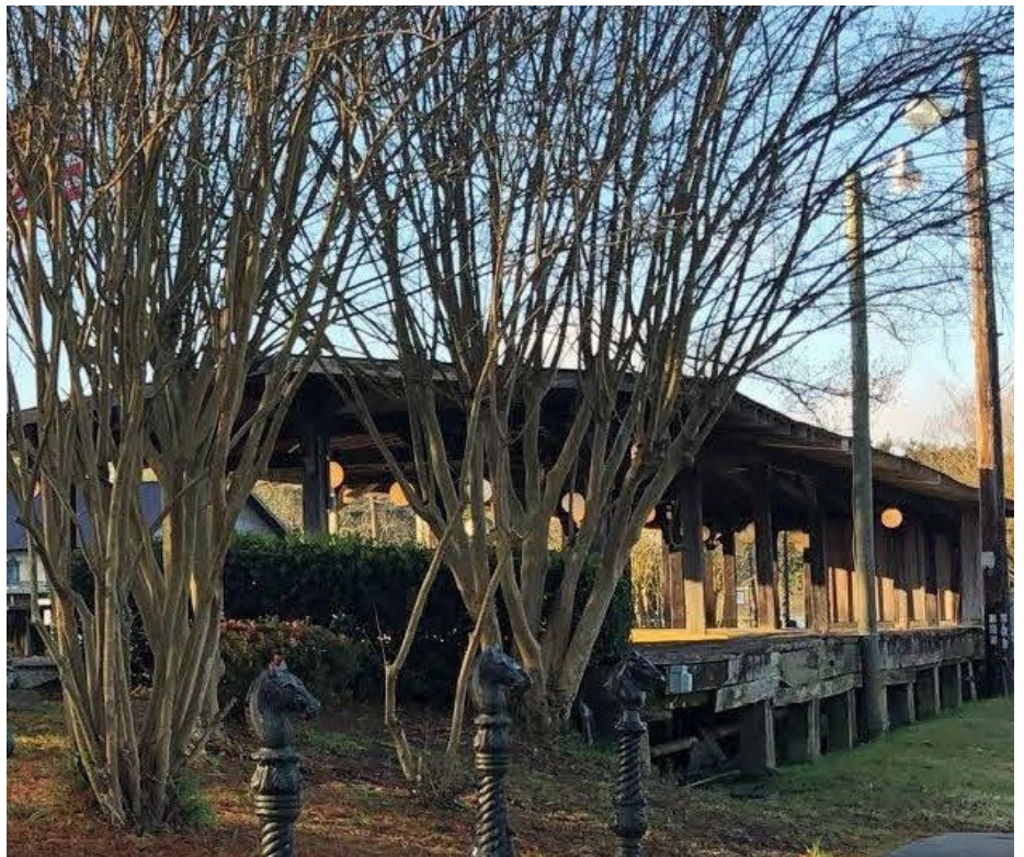
Railroad Depot in downtown Churchpoint.

Our Technical Assistance Program awarded a $20,000 Technical Assistance Grant to Acadiana Planning Commission (APC) to assist the Town of Churchpoint in conducting Brownfields-related community outreach. They also enhanced their inventory of potential Brownfield sites specifically in their historic downtown area. APC and the Town then used the inventory to identify catalyst sites for future economic development activities. APC also developed a retail market analyses to generate ideas for future redevelopment. Coordinating their efforts with the mayor, council members and the Church Point