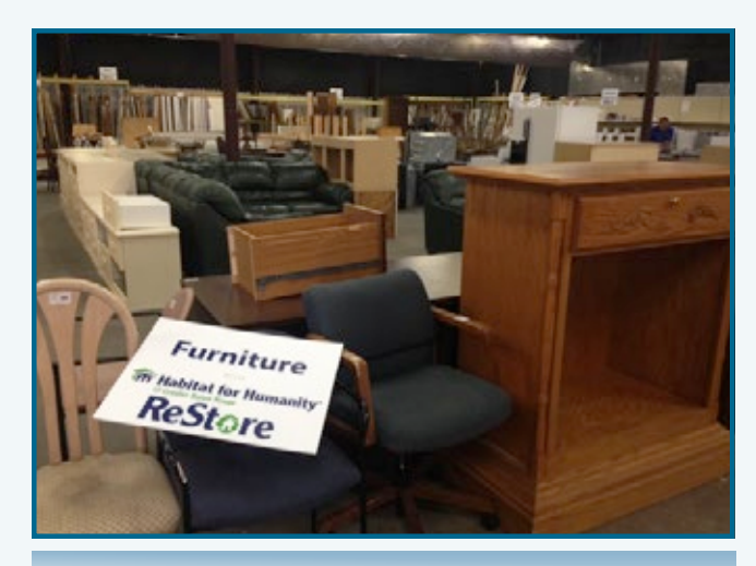
The ReStore specializes in selling construction materials, furniture and furnishings for the home.

Each year, the ReStore participates in the paint swap during household hazardous materials collection days held in Baton Rouge. LDEQ volunteers handle the intake and mixing of used paint at the event then the paint is sent to the ReStore's north Baton Rouge site where store staff blends the paints accordingly. Paint is then separated into containers by color, labeled and resold to the general public.