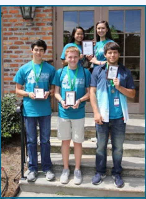
Second place Envirothon Winners Quitman High School-Future Farmers of America