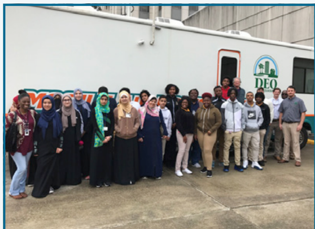
Students from Scotlandville High School and Bright Horizon School visited LDEQ for job shadowing day.