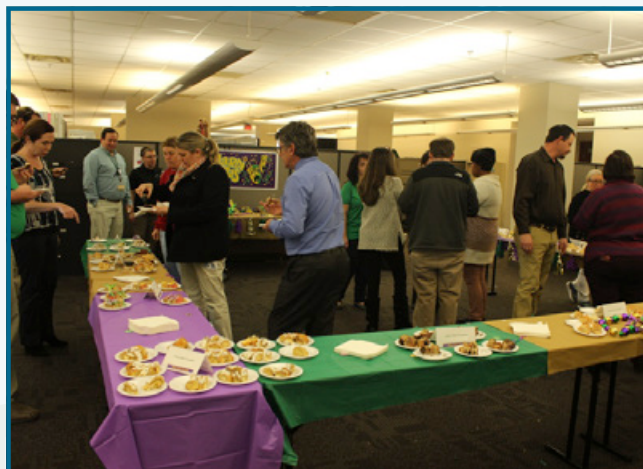
LDEQ employees taste and vote on the best king cakes.