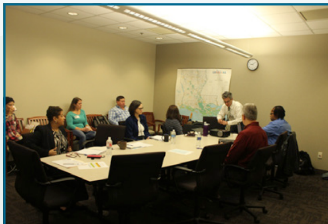
Members of LDEQ’s Nonpoint Source Group, LDAF, and EPA Region 6 wait for the start of a presentation.

Once a year, the LDEQ Nonpoint Source Program (NPS) and Louisiana Department of Agriculture and Forestry (LDAF) have an extended review conducted by EPA Region 6, to review the goals and accomplishments of the program. This year, the Clean Water Action Program review was hosted by LDEQ. The topics of discussion during the four day meeting included areas of success in 2017, areas that need improvement, special projects, watershed implementation plans and NPS Management Plan, reporting and tracking, and collaboration and partnership.