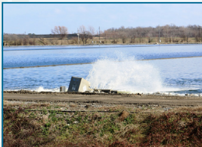
Powerful pumps are used in the aeration process at the Sparta Reuse Facility in West Monroe.

For more information, visit www.westmonroe.com .