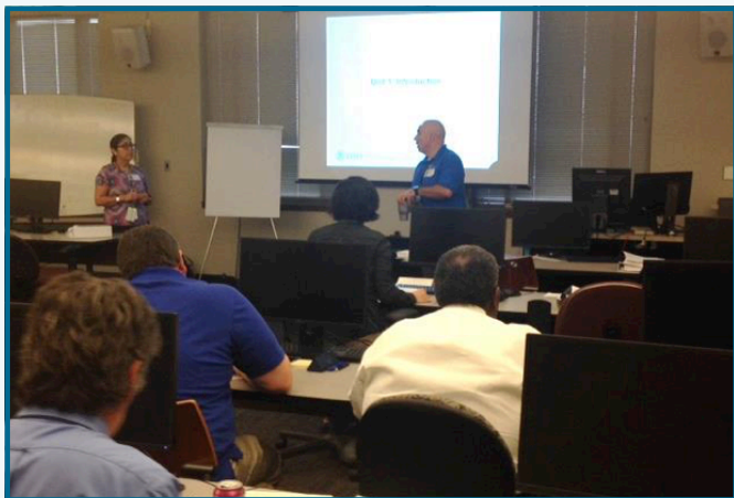
FEMA hosts a Radiological Emergency Preparedness exercise controller training at LDEQ Headquarters Feb. 22. The course prepares participants to control the flow of the scenario events to ensure a nuclear event exercise is conducted in accordance with exercise objectives and extent of play.