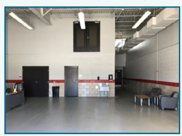
The inspection sticker challenge station features a large inspection bay, classroom and waiting area.

A motorist can take their vehicle to the challenge station as many times as needed in order to resolve the repair(s). The motorist has 30 days from the time of the failure to fix their vehicle and obtain a passing inspection sticker before being subject to a citation by law enforcement.