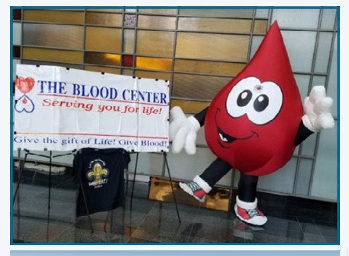
Betty Blood Drop encourages LDEQ personnel to donate blood.

LDEQ works with many organizations like Bayou Vermilion District on monitoring and improving water quality in Louisiana. For more information on water programs LDEQ administers, visit deq.louisiana.gov/subhome/water .