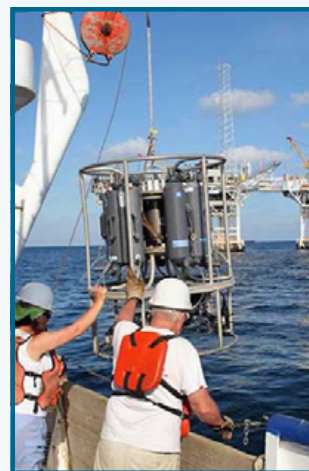
2nd Mapping instruments being lowered into the Gulf on the mapping shelf wide cruise

decreases to a level that can no longer support living aquatic organisms. When there are excessive amounts of nitrogen and phosphorus in the water, algae can bloom to harmful levels. Dead zones form when the algae die, sink to the bottom and are decomposed by bacteria — a process that strips dissolved oxygen from the surrounding water.